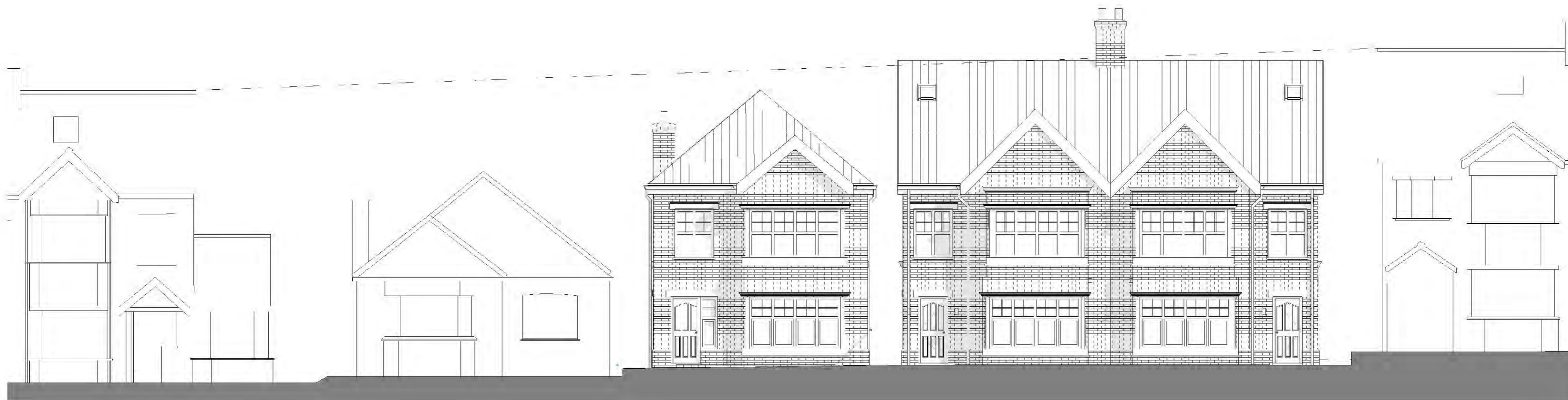
② Proposed Elevation - Street Scene 1 : 100